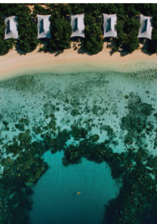
BEACH SUITES AT BAWAH RESERVE, INDONESIA

That said, closer to home somehow feels right, right now. Southern Europe is the place many of us, from Sausalito to Sydney, have been dreaming about. Those lucky enough to be able to access the Schengen Area this summer will be gratified to know there is a clutch of great