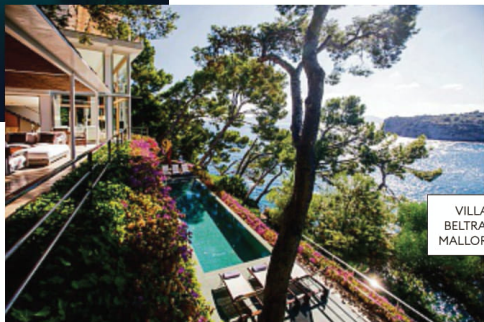
VILLA BELTRAN, MALLORCA