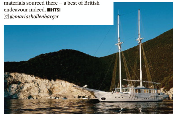
Below: the schooner Alexa J in Greece

The temperature is climbing. In 24 hours the northern hemisphere will reach peak daylight. Summer is here – and myriad thoughts are turning, pandemic caution or no, to the seaside. The state of travel play means much of the world is still unreachable for most of us. However, for those so inclined, and possessing the means (and Gulfstreams), a clutch of justifiably famous private-island resorts – among them Mnemba in Tanzania and Indonesia's extraordinary Bawah Reserve – should soon be available for exclusive buy-outs (with all the aquatic trimmings, naturally, from full PADI dive centres to fishing kit to on-site marine conservationists).